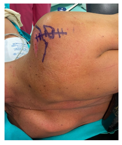
Figure 4. Surgical approach through deltoid muscle.

Surgical management consisted of a posterior surgical approach through right deltoid muscle with a 6 cm long incision placed directly over the posterolateral angle of the acromion ( Figure 4 ).