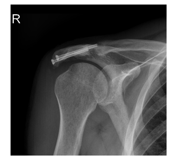
Figure 6. Radiographic control at 6 months

first radiographic control after 1 month; radiographs was found to be acceptable with a good bone consolidation and a normal subacromial space. Patient was then allowed to start active and passive exercises under the supervision of a physiotherapist. Subsequent clinical and radiographic controls carried out at 4 and 6 months after surgery showed a remarkably stable fracture, without displacement and a noticeable improvement in physical performances ( Figure 6 ).