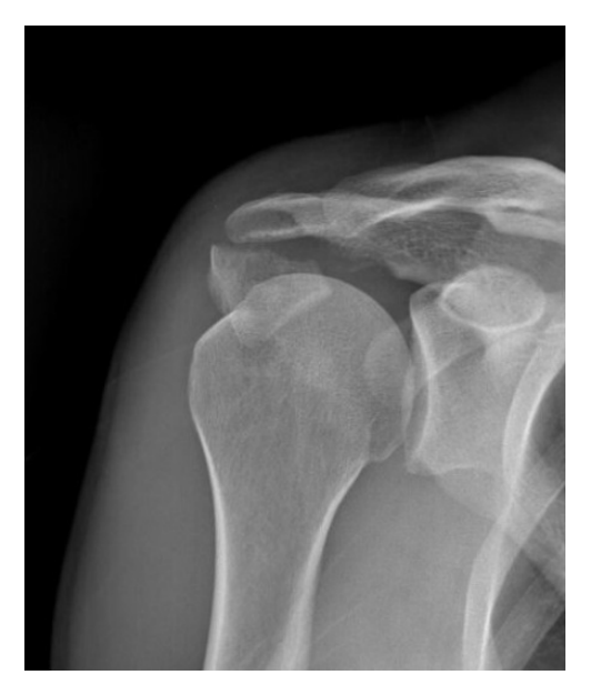
Figure 1.: Preoperative anteroposterior x-ray image.

Clinical examination showed normal neurological assessment. During shoulder inspection and palpation, a deformation with over morphological crepitius posterolateral angle of the acromion was pointed out. Anteroposterior and lateral radiographic views of right shoulder showed a displaced fracture of the posterolateral angle of the acromion with a reduction of the subacromial space; no associated injuries were found. 3D reconstructed computer tomography provided more details on fracture allowing an optimal classification. Fracture was classified as a Khun stage III (because of the inferiorly displaced fragment and the reduction in the subacromial space) and Ogawa type I (fracture interested the anatomic acromion) (Figure 1 and 2).